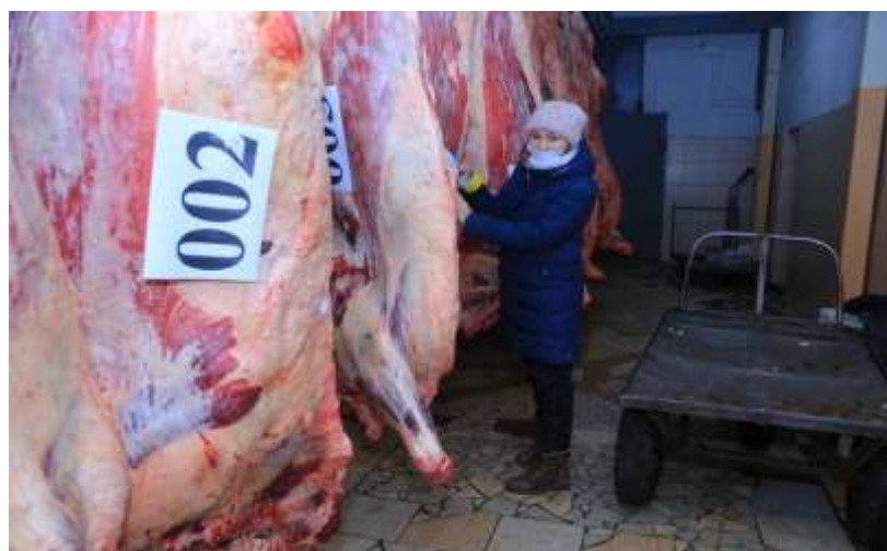
Figure 2 – Carcasses of Kalmyk bulls slaughtered at Karasu Et slaughterhouse

One of the important indicators characterizing the slaughter result is slaughter yield [14, 15]. According to the study, the slaughter yield of bulls of producer Moryak-12054 was higher than that of bulls of producer Stroiny-2520 by 1.2 kg or 1.02% at 15 months and by 0.9 kg or 1.01% at 18 months. The highest slaughter yield was observed in 15-month-old steers of Moryak -12054 - 57.5%.