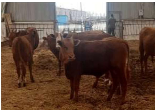
Figure 1 – 15-month old progeny of the bull breeder of the breeding line Sailor 120541 taken for research

Materials and methods of research. The object of the study is bulls of the Kalmyk breed at the age of 15 and 18 months. The research work 2021-2023 was carried out in conditions of LLP "Moskovskiy" of the North-Kazakhstan region. Slaughter quality was studied at the slaughter of 3 heads from each group at the age of 15 and 18 months from descendants of factory lines Moryak - 120541, 3 heads of descendants of factory lines Strojny - 2520 at the age of 15 and 18 months.