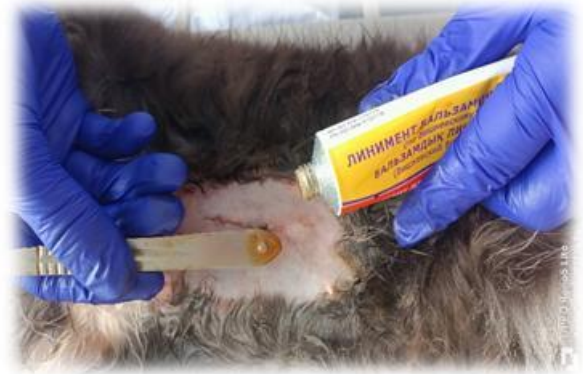
Figure 1 – Postoperative wound treatment in the experimental groups (Day 1)